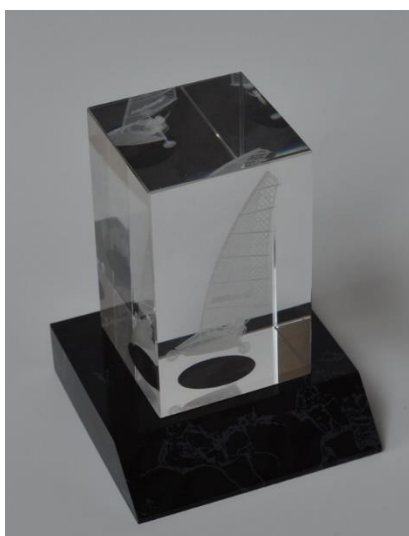
NZBAI blokart championship 3D laser etched crystal trophy

Club members took part in the New Zealand Blokart Open at Wigram, with the Club represented on the podium across all six race divisions, with 1 st places in four of the six divisions. The 2017 South Island Blokart Open was abandoned due no wind.